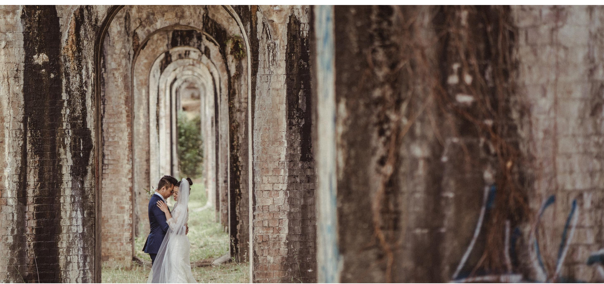
CINEMATIC FILMS INE ART PHOTOGRAPHY